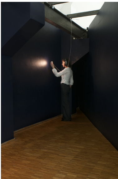
Exhibition view